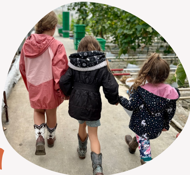
Family Farm Day 2023

This is a great opportunity for folks to experience and support local agriculture as well as get inspired with what you can grow in your own backyard.