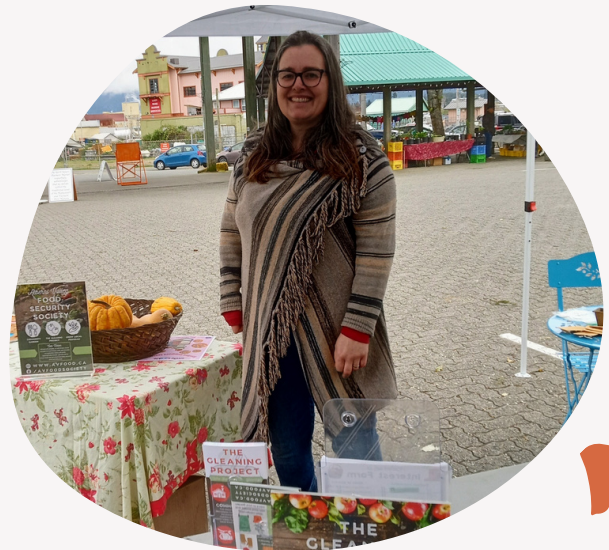
Farmers' Market Outreach