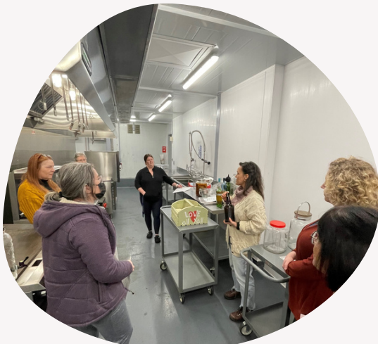
Food Skills Workshop