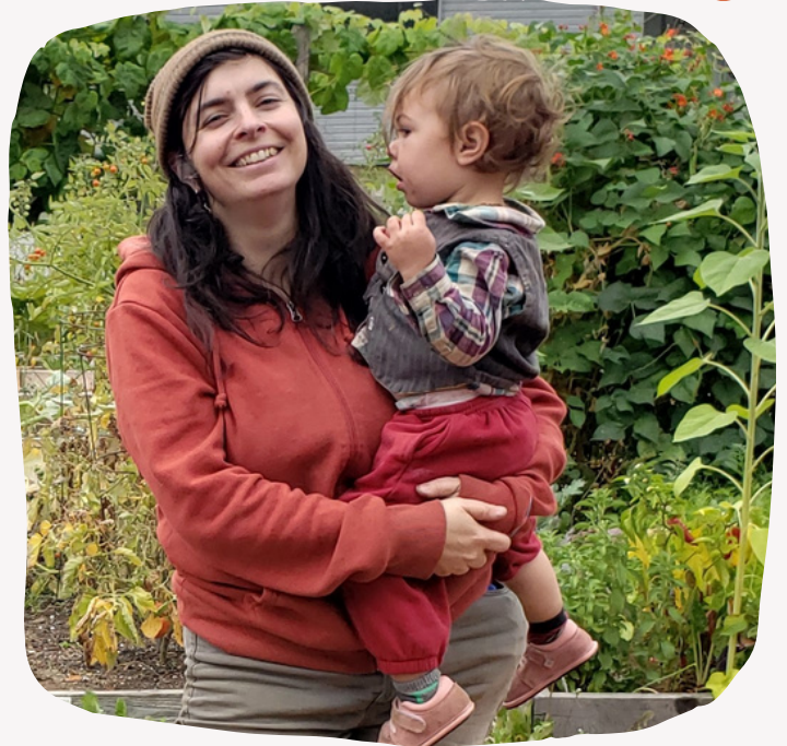
Refurbishing garden beds at garden work party